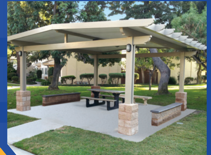
▼ Commercial picnic area cover