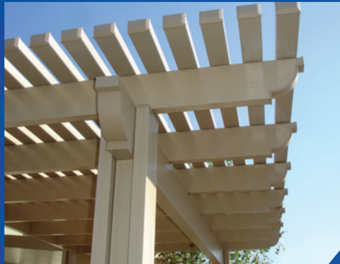
▼ Weatherwood™ lattice cover with Corbel end cuts