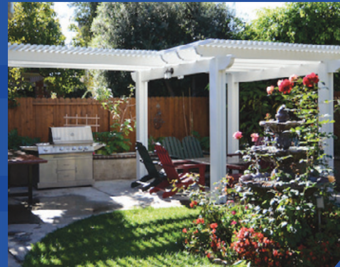
▼ Free-standing lattice cover