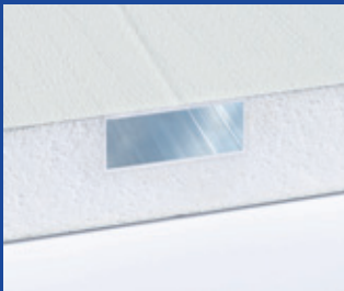
Internal Raceway Beam designed to support a ceiling fan or light fixture