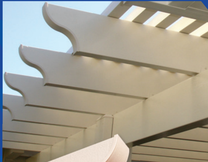
▼ Weatherwood™ lattice cover with Scallop end cuts