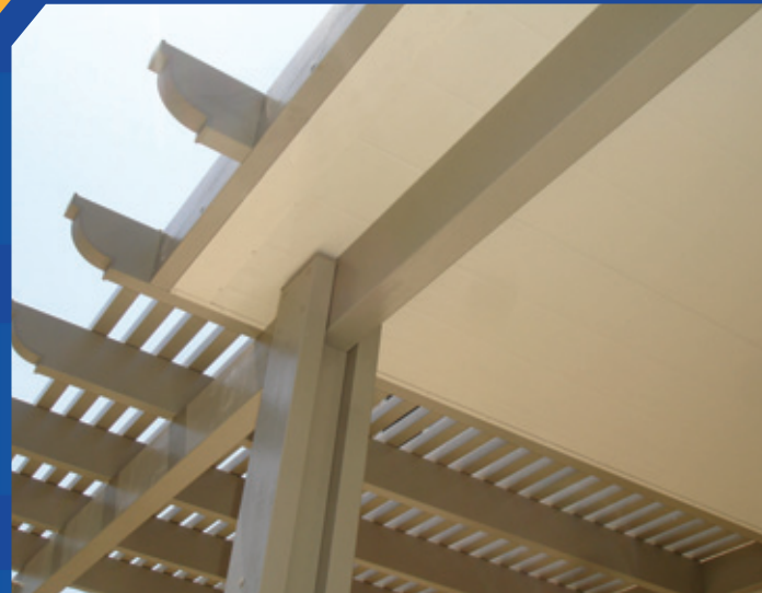
▼ Lattice and Solid combination with Corbel end cuts