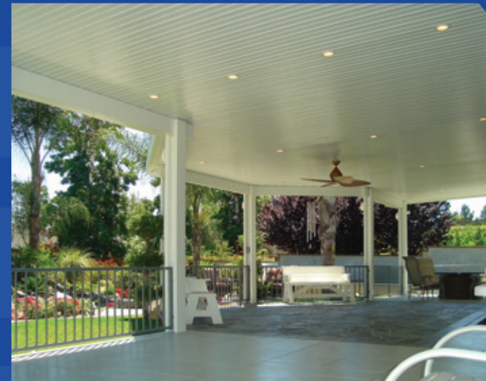
▼ Solid cover with Light Strips™