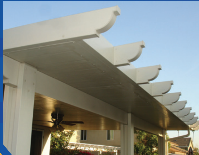
▼ Weatherwood™ solid cover with Corbel end cuts