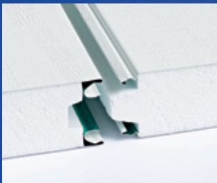
Positive Panel Interlock Design

Duralum's Weatherwood™ Insulated Roof Panel enhances your patio living area with the natural look of solid wood, while providing you with the durability and maintenance-free performance of aluminum. Ideal as a solid cover or roof for your Duralife™ sunroom.